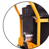
220 CFM DUST PORT