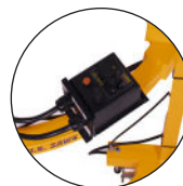
VARIABLE SPEED CONTROL BOX (OPTIONAL)