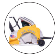
ALUMINUM ALLOY CHASSIS