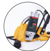
EQUIPPED WITH METABO