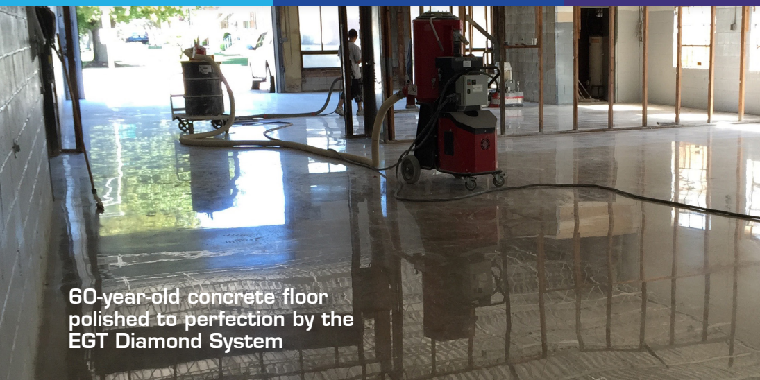
60-year-old concrete floor polished to perfection by the EGT Diamond System